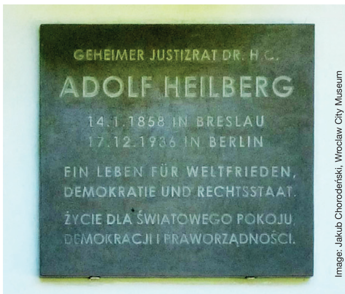
commemorative plaque unveiled in Wroclaw on 30 May